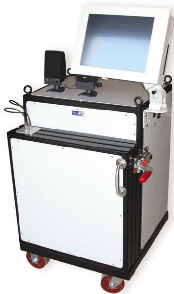
BM-185D Gamma 1 ft 3 box monitor